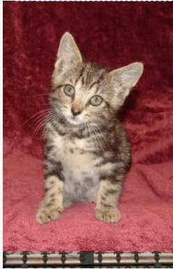
BARON— MALE, 4 MONTH OLD, DOMESTIC SHORTHAIR/MIX AVAILABLE AT THHS

accomplishes several objectives, the main goal being that the dogs find forever homes.