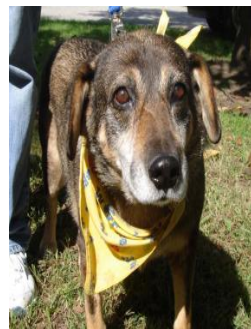
BEA—6 YR OLD, FEMALE SHEPHERD/MIX AVAILABLE AT THHS