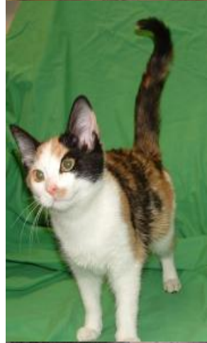
SNAPPLE-SPAYED FEMALE, 4 MONTHS OLD, DOMESTIC SHORTHAIR/MIX AVAILABLE FROM THHS