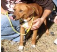
Susan, Female Labrador Retriever mix, available at THHS

The Terre Haute Humane Society was incorporated in 1913. The objective of the society at that time was to prevent cruelty to children and animals. Although the scope of our problems today are far different than in 1913, the goal remains the same. At that time there was little mention of dogs and cats, the focus was the neglect and abuse of beasts of burden.