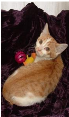
BERNIE-5 MONTH OLD, MALE, DOMESTIC SHORTHAIR/MIX AT THHS

You will notice that several of these items can be new or used. What a great way to recycle!