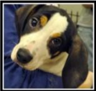
Mikey is a 3 month old male, neutered Beagle /Mix that is looking for a forever home for the holidays! Come see him!

Phone: 812-232-0293 E-mail: adopt@thhs.org http://www.thhs.org