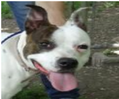
Tyra is an 18 month old spayed terrier/mix who is looking for a forever home.

DID YOU KNOW THAT THHS IS A PRIVATE ORGANIZATION, NOT A CITY OR COUNTY SHELTER? WE EXIST SOLELY ON ADOPTION AND OWNER RELINQUISH FEES AND YOUR GENEROUS GIVING OF MONEY, TIME AND TALENT.